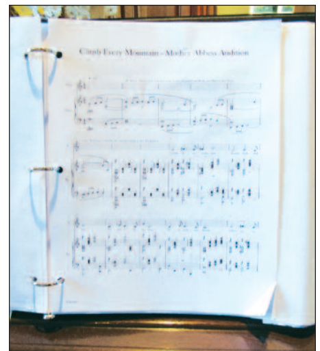
Music for "Climb Every Mountain."